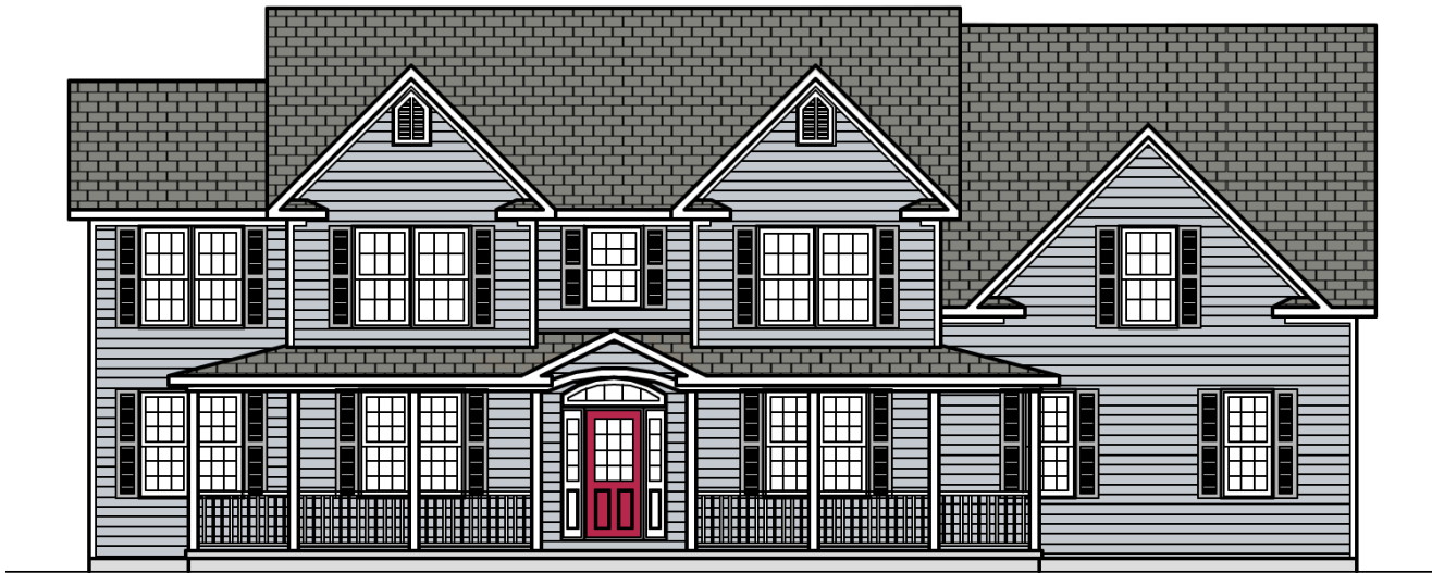
optional railing shown