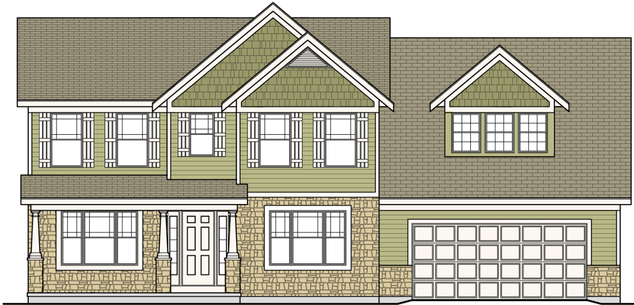
Elevation C shown