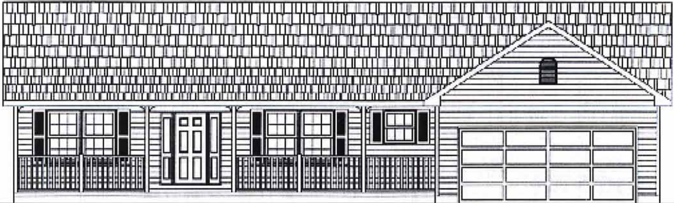
Optional Porch Railing Shown