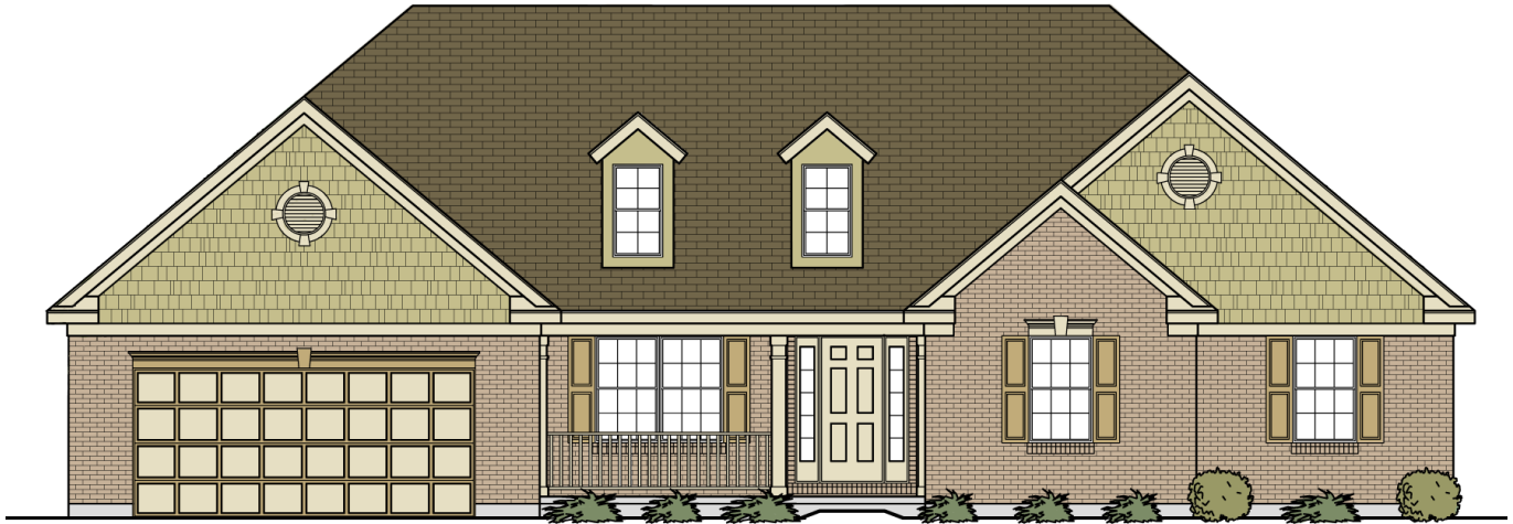
Elevation - Front